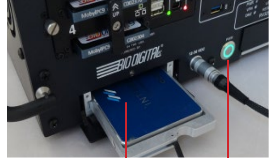
Removable SSD storage

The MDC-8 allows for hot swapping of the BioDigitalPC® server cards. When completely scaled out, the MDC-8 allows for 8 BioDigitalPC® cards containing a total of 8 to 32 CPU cores, up to 128GB DDR4 RAM, up to 8TB of onboard ultra-fast NVMe SSD storage, and comes with 4TB (2 x 2TB) of expanded SSD storage in a RAID configuration, optional 8TB (2 x 4TB).